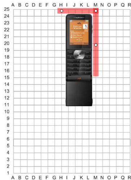
Rohde & Schwarz Shield Box and Coupler (M25)